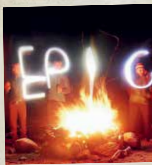
The photo is the caption!