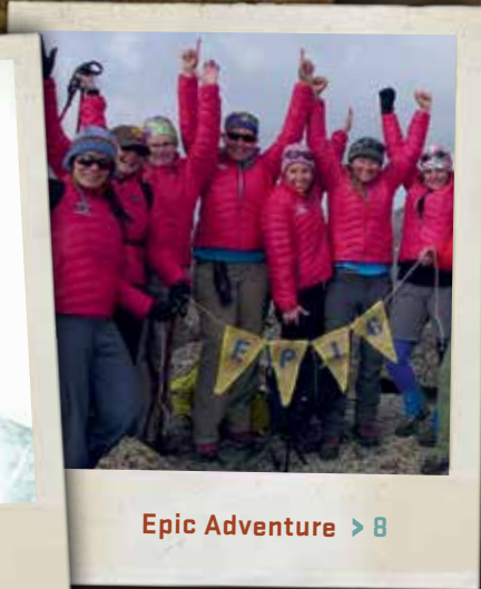
Epic Adventure > 8