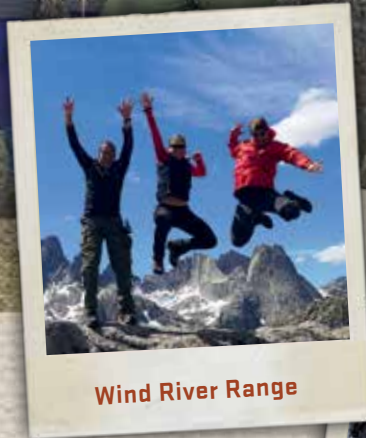
Wind River Range