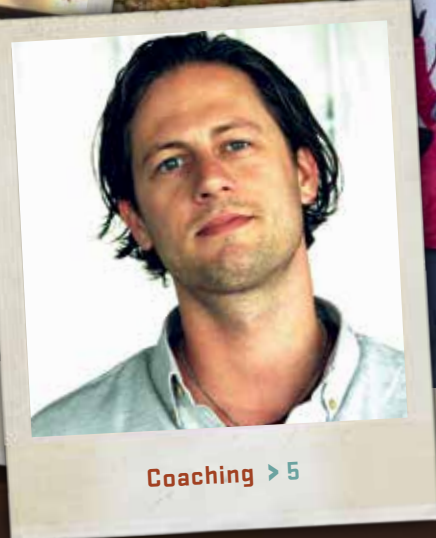
Coaching > 5