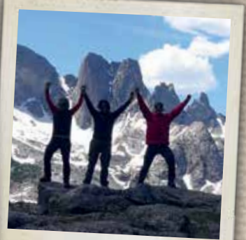
Cirque of the Towers