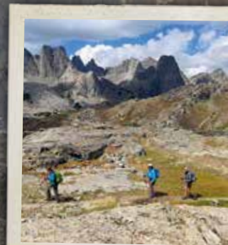
Cirque of the Towers