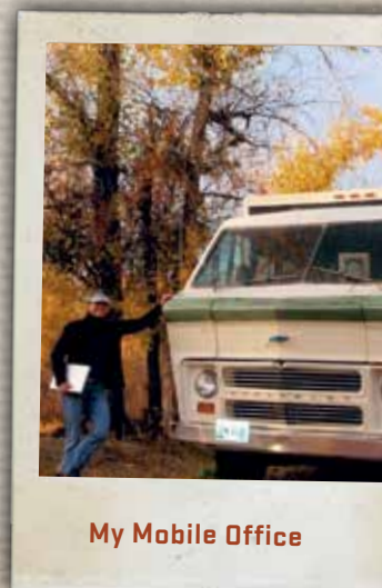
My Mobile Office

Mostly, I am a champion for hire. My mission is to dare you to take chances, to play bigger in your life, so that you feel more alive, and have more unforgettable moments. I want you to live more , and to live, and lead, with no regrets .