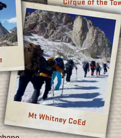
Mt Whitney CoEd

WE CAN GO FARTHER THAN WE THINK WE CAN - IF ONLY WE DARE TO.