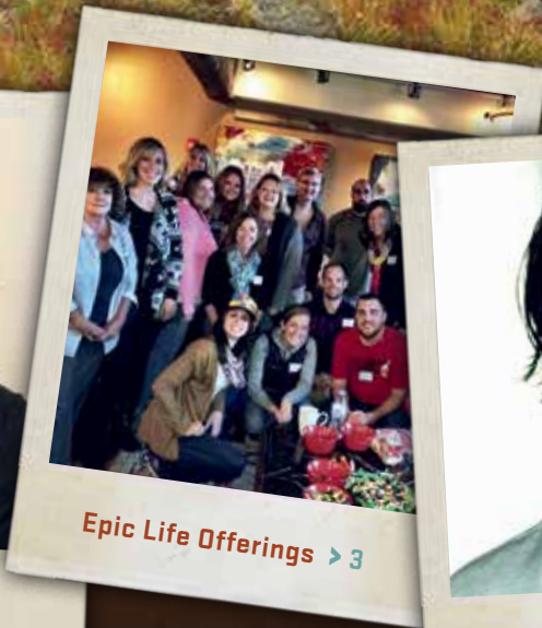
Epic Life Offerings > 3