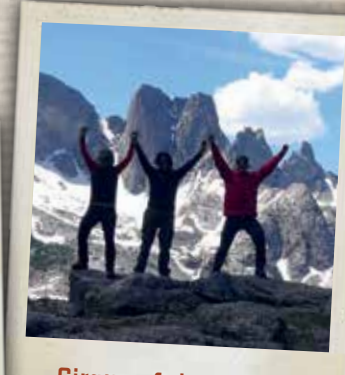
Cirque of the Towers