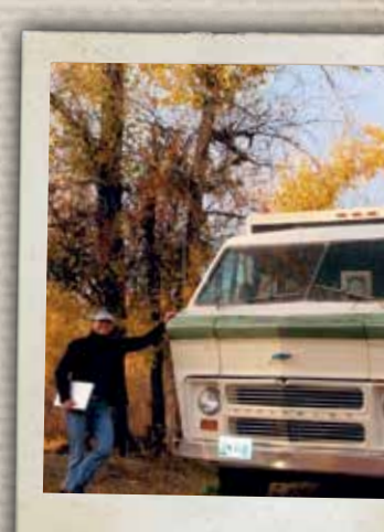
My Mobile Office

Mostly, I am a champion for hire. My mission is to dare you to take chances, to play bigger in your life, so that you feel more alive, and have more unforgettable moments. I want you to live more , and to live, and lead, with no regrets.